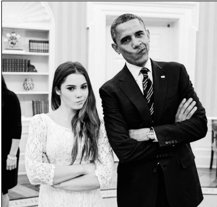
President Backfor Fourmore and gymnast MyCayla Baloney are not impressed with the news that the School of Cosmetology is joining the Big Ten.

"Look, it's a great college, or at least that's what somebody told me. But it's not a good fit for the Big Ten. I mean, their mascot is the dodo bird. That bird is extinct. Can you imagine having an extinct bird as a mascot? It would be like having