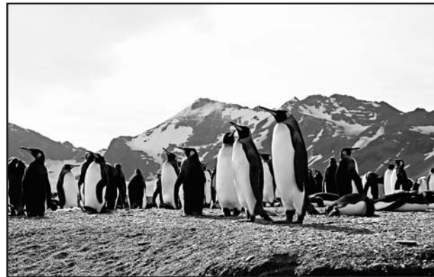
Penguns found in Eaton County are evidence of either: A: Global warming. B: Michigan's tax credits for movies are working or C: Fish in the Grand River are OK to eat after all.

"Apparently, this colony migrated to their new home to find adequate food, since overfishing of Patagonian Toothfish in the Antarctic Ocean.