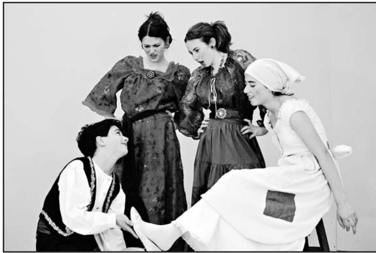
Least Lansing council members discuss the fit of the glass slipper on a job candidate. The ACLU is planning a lawsuit against the city. "The shoe is a blatant attempt to keep men off the council," it said.

In addition to the traditional application process, in which candidates outline their qualifications, background and desire to serve on the council, the interview process required them to try on the fragile shoe.