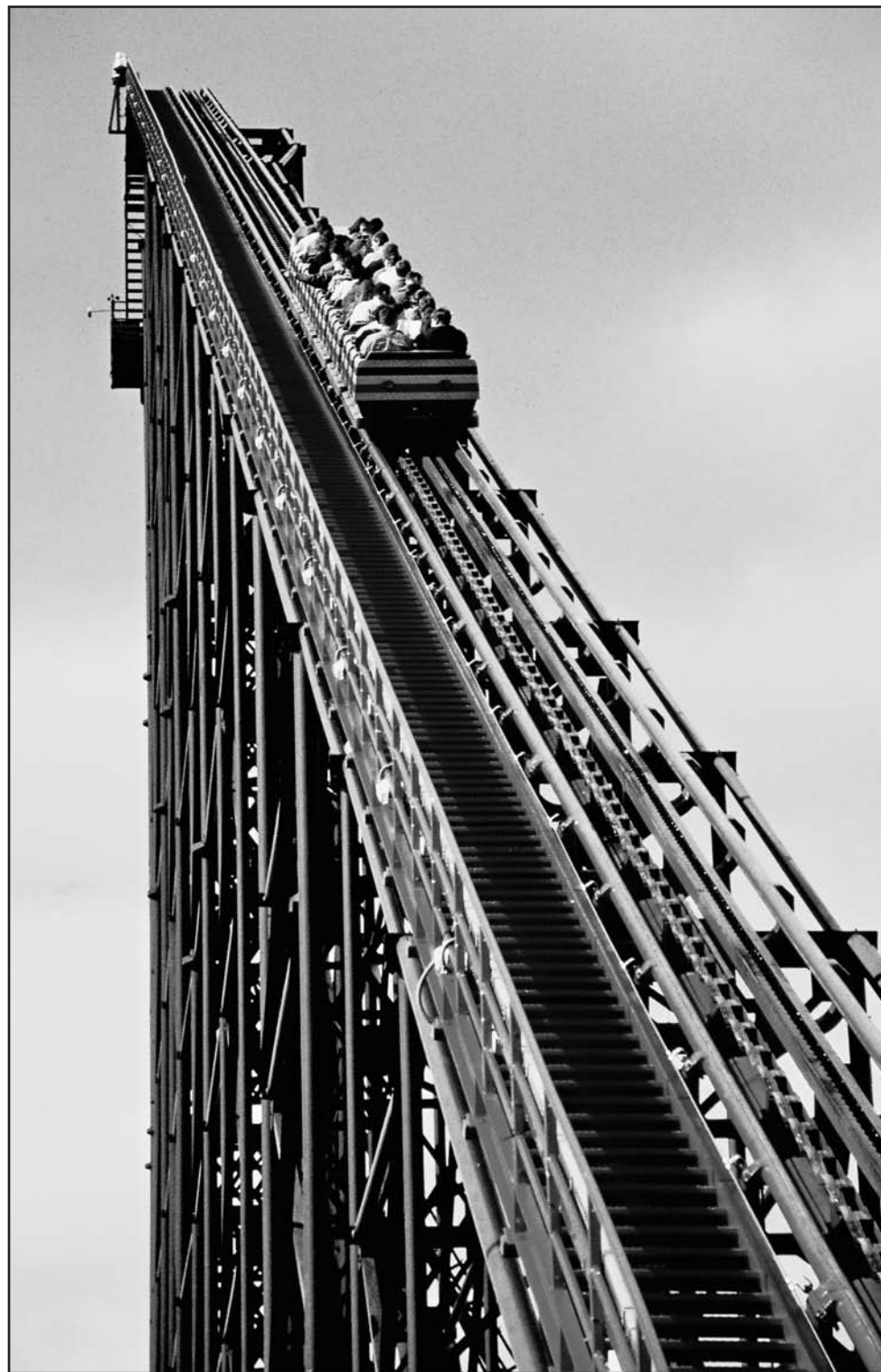
Visitors leaving Detroit head to the top of the new Bridge-Coaster that will drop them like a rock directly into customs in Canada.